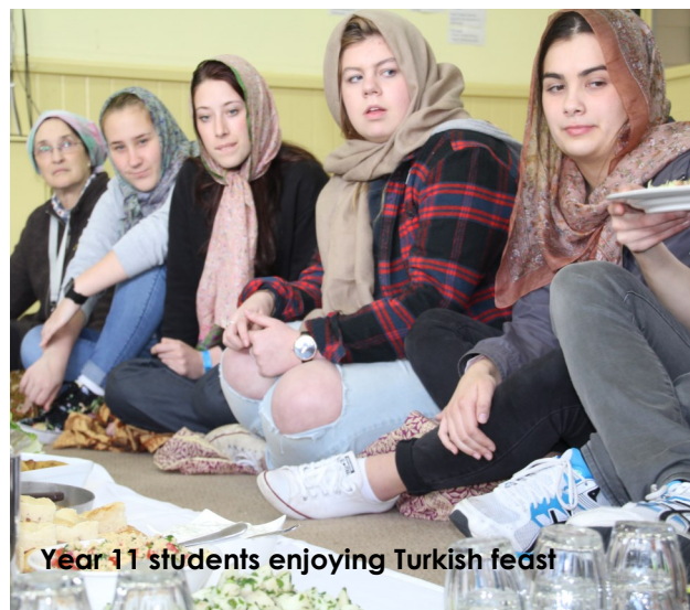
Year 11 students enjoying Turkish feast